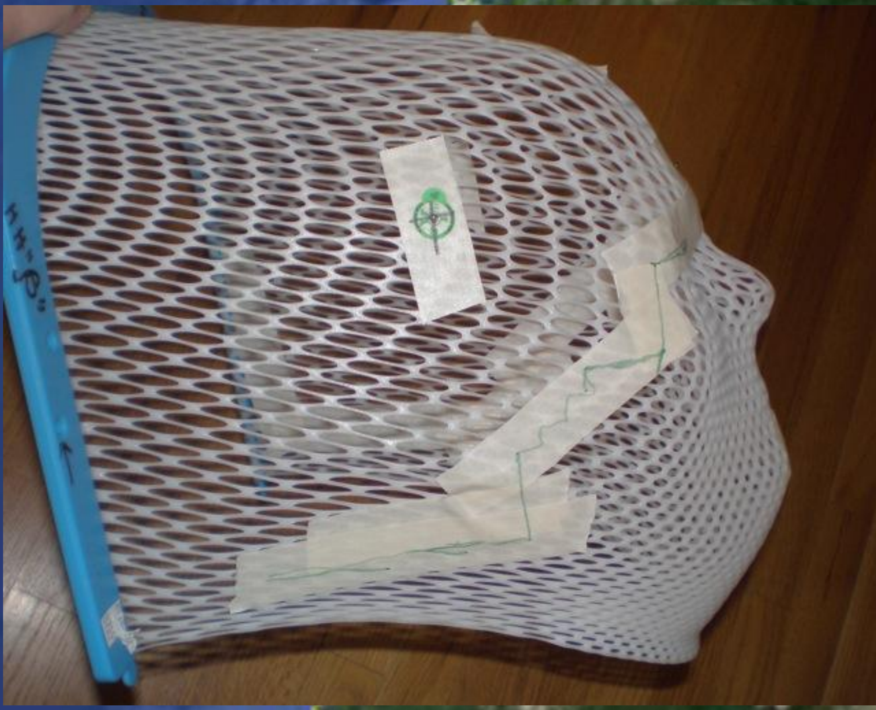
Frameless Stereotactic Localization