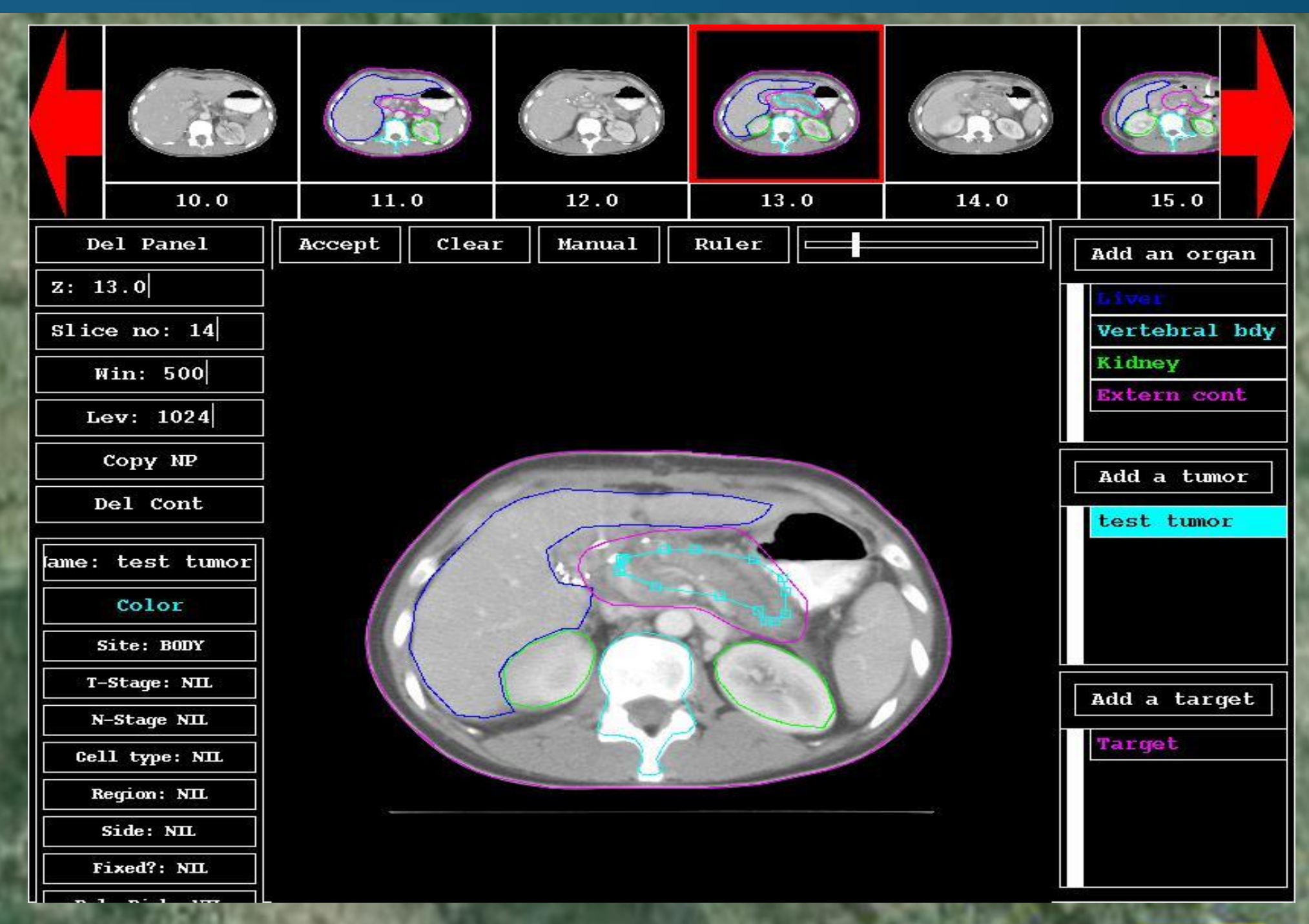
Prism RTP system, developed at the University of Washington in 1994

Dated this 26 day of FEBRUARY, 1975 Signed: Handwritten signature , Secretary-Treasurer Handwritten signature , President (American Association of Physicists in Medicine)