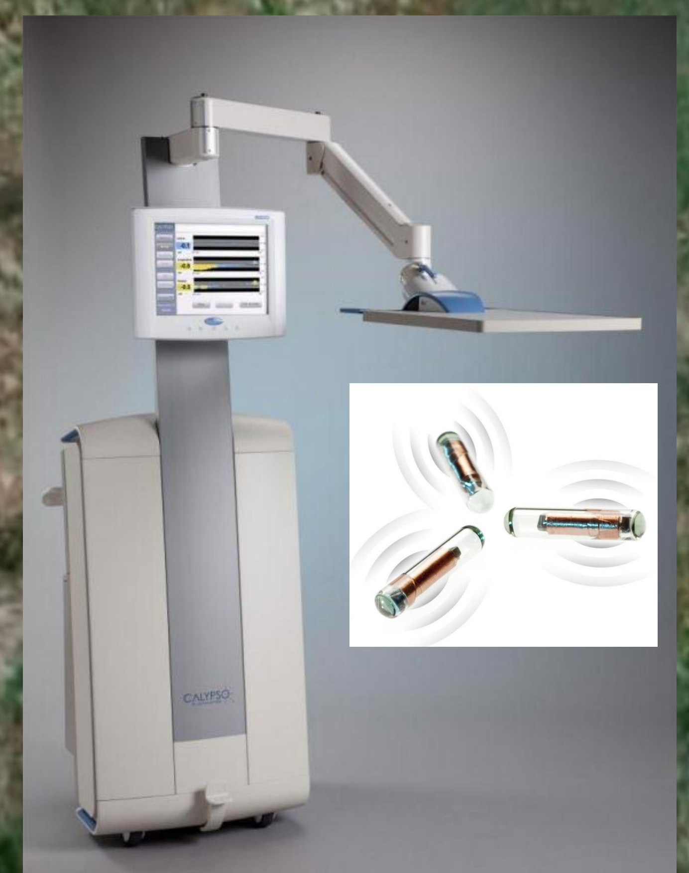
Calypso® System, for real-time tumor motion tracking, developed in Seattle and acquired by Varian in 2011